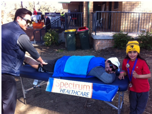
Another satisfied customer!

Spectrum Healthcare is located in the Specialist Medical Centre complex in North Ryde and should you require their services they are extending special student rates for all Dockers players for Physiotherapy, Sports Chiropractic and Massage Therapy.